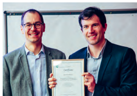
CAS-HSG Certificate and 10 ECTS after finishing all modules plus Transfer Paper