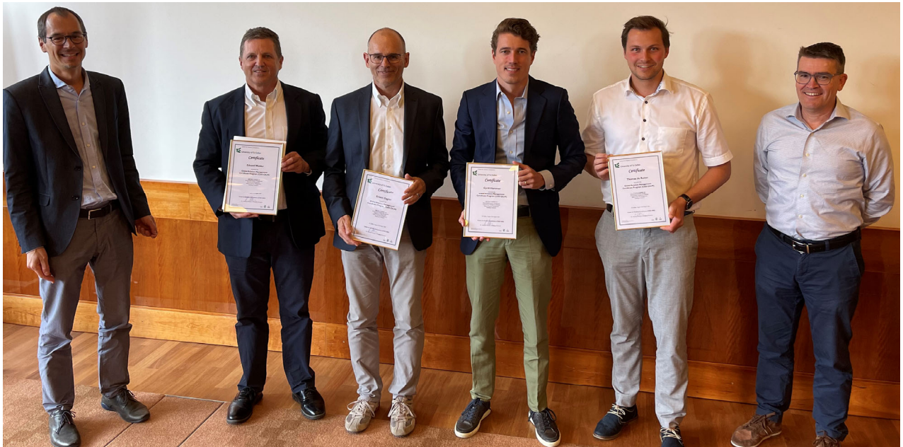
CAS Graduates 2021:

Internal auditing becomes highly important to ensure consistently compliance. This module deals with compliance, the basic regulations to it and with how to install efficient internal auditing processes.